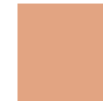
10 NUDE 4100808