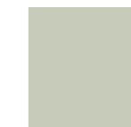
36 SALVIA 4100834