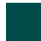
39 PEACOCK 4100837