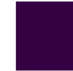
05 PURPLE 4100803