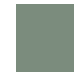
35 MUSK 4100833