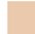
11 POWDER 4100809