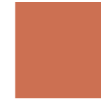
03 CORAL 4100801