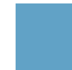
30 POOL 4100828