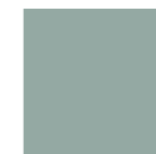
33 SKY 4100831