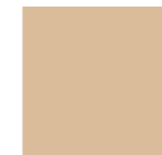
19 NUT 4100817