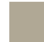
23 GREY 4100821