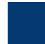
28 OCEAN 4100826