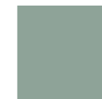
34 CELADON 4100832