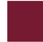
04 BORDEAUX 4100802