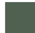
37 MILITARY 4100835