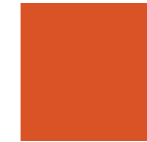
02 LOBSTER 4100800