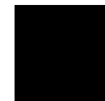
25 BLACK 4100823