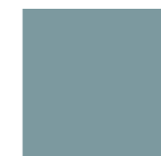
32 CLOUD 4100830