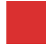
01 RED 4100799