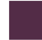
06 VIOLET 4100804