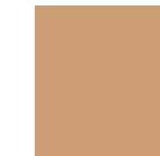
12 TERRA 4100810